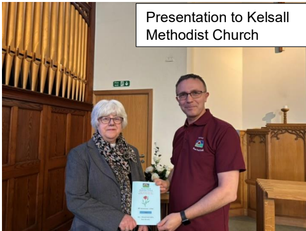
Presentation to Kelsall Methodist Church