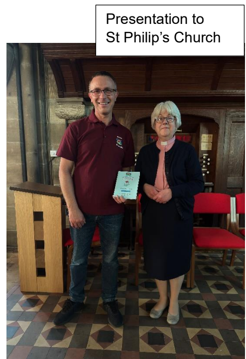
Presentation to St Philip's Church