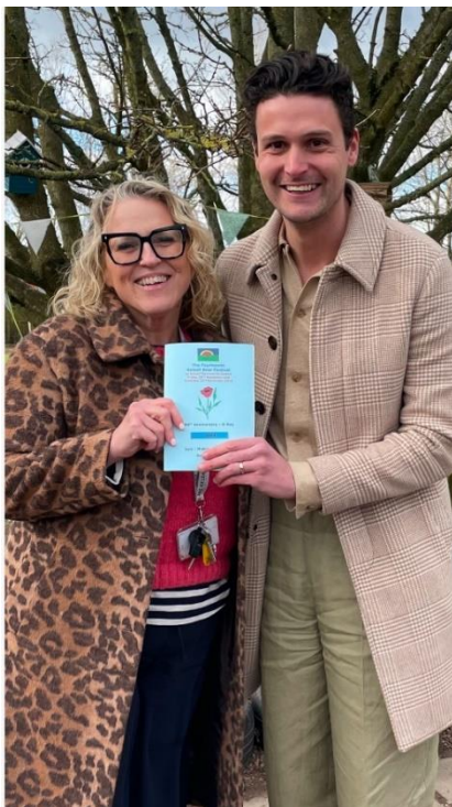
Presentation to Kelsall Primary and Nursery School