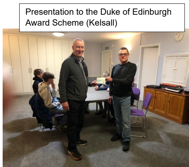
Presentation to the Duke of Edinburgh Award Scheme (Kelsall)