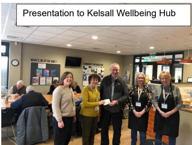
Presentation to Kelsall Wellbeing Hub