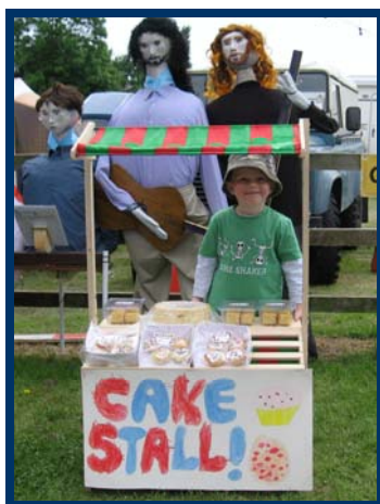
Our youngest salesperson raises more than £40 at Kelsall Folk Festival

kelsallgreen@googlemail.com or contact Tara at 752 720.