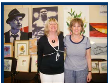
Art Exhibit raises more than £1,700 (Page 2)

Help maintain the momentum! Please support the events listed in this newsletter.