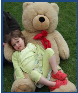
Kelsall's teddy bears gather to support The Green

Published by: Kelsall Recreation Committee Contact: kelsallgreen@googlemail.com For Updates: www.kelsall.org.uk