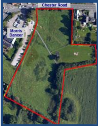
Aerial View of Kelsall Green

Published by: Kelsall Recreation Committee Contact: kelsallgreen@googlemail.com For Updates: www.kelsall.org.uk